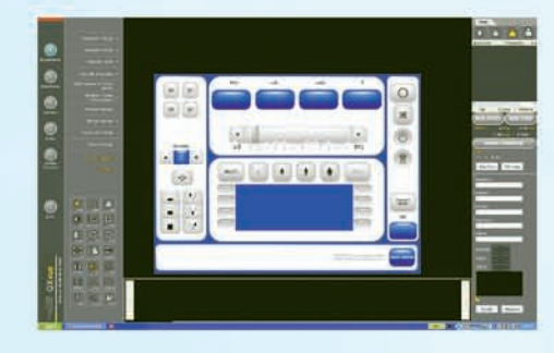
Generator Integration, CCD